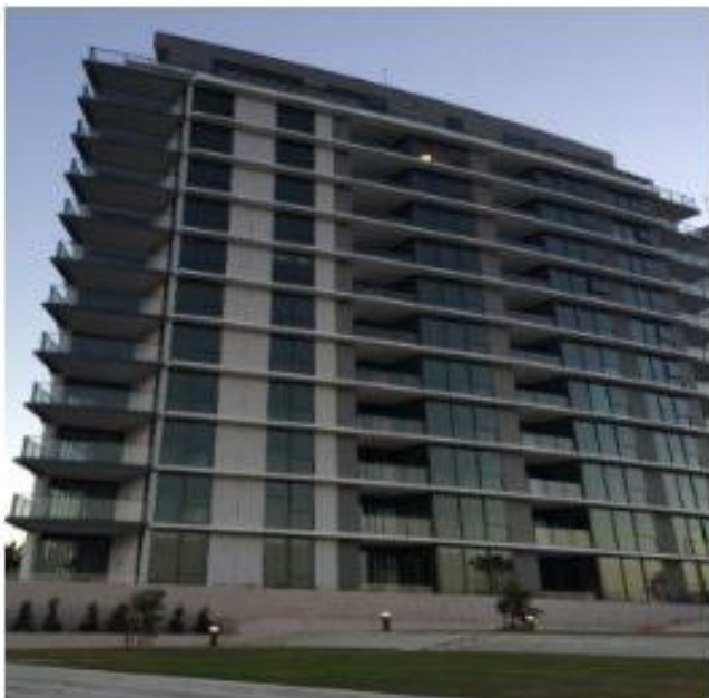
Wolli Creek Stage 07