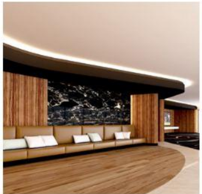
Strathfield Golf Club