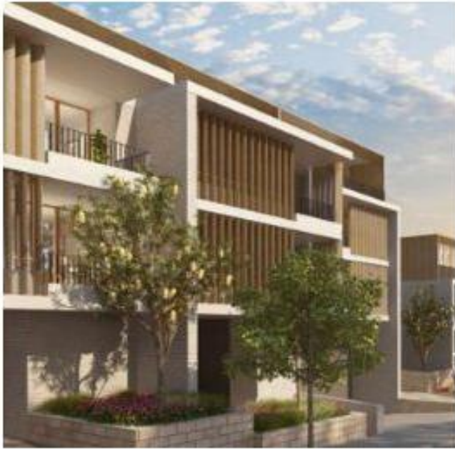
100-102 Elliot Street Balmain